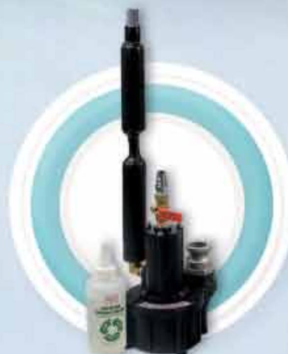
Air Sump Pump / Air Rotor Lub Oil